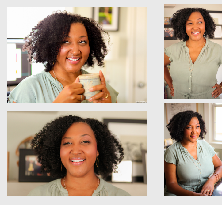
Note: All pricing is subject to change without notice and available for a limited amount of time *For Personal Branding photo shoots additional cost will be applied to locations over 40 minutes drive round trip and travel outside of New Jersey. Additional costs may apply.

2 payments of $250 plus tax $250 plus tax retainer is due upon signing of the contract in order to schedule your Personal Branding photo shoot date. The balance is due when gallery has been delivered.